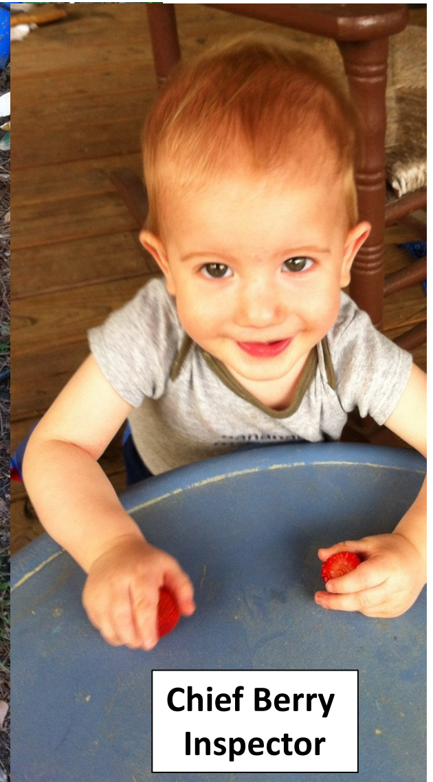
Chief Berry Inspector