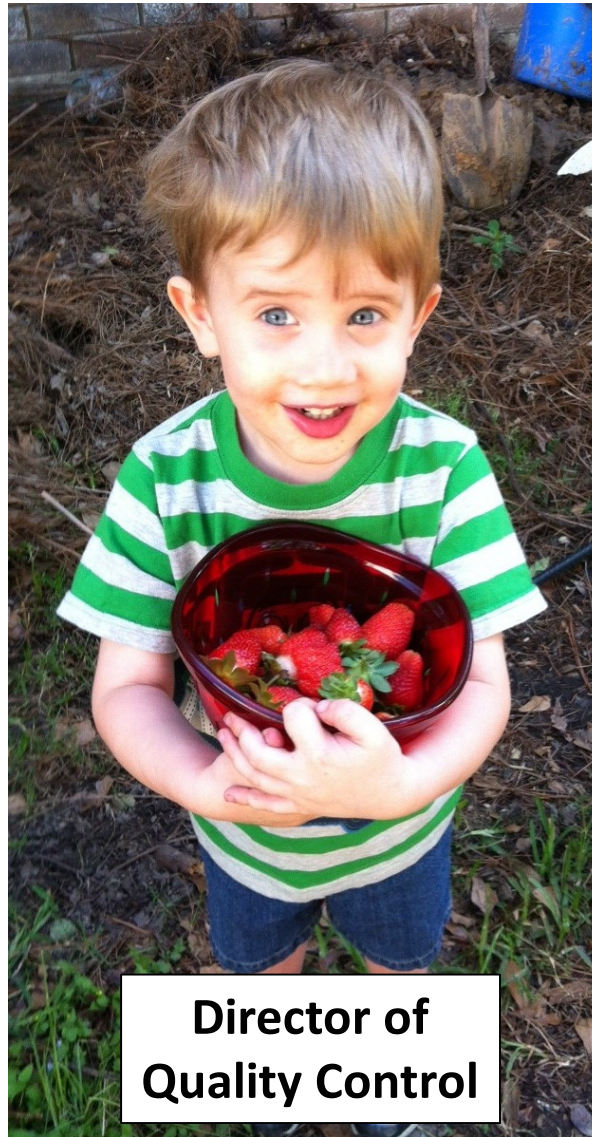
Director of Quality Control